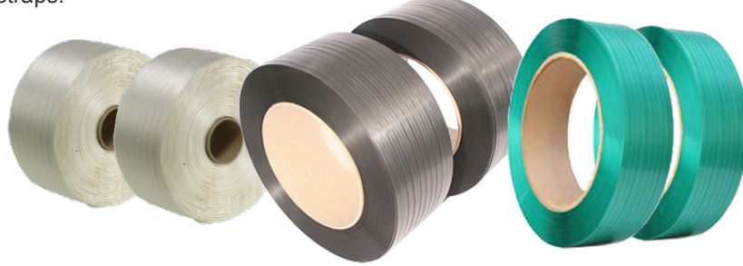
Available for a wide variety of strap seals and buckles

Sal-Tech Easy Packaging offers a wide variety of manual and battery powered hand strapping hand tools. We offer Combination Tools, Tensioners and Sealers compatible for PP,PET and WG straps.